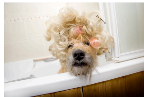
Crazy Hair Day