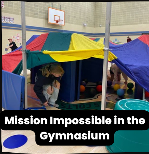
Mission Impossible in the Gymnasium