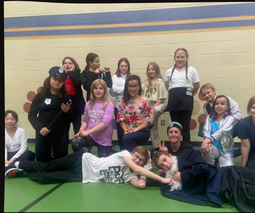
The "Million Dollar Meatballs" production from our Drama Club