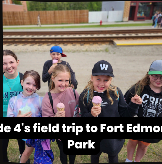
Grade 4's field trip to Fort Edmonton Park