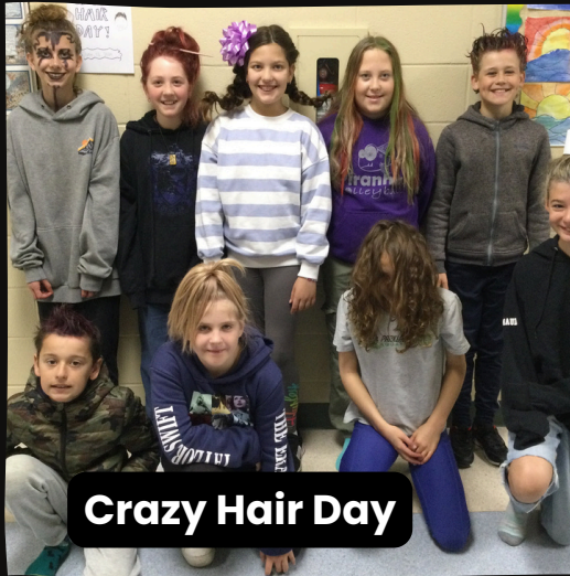
Crazy Hair Day